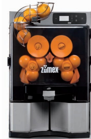
Zumex Essential Silver