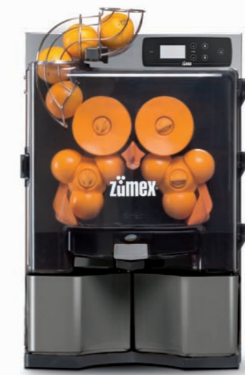
Zumex Essential Graphite