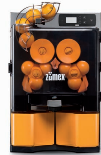
Zumex Essential Orange